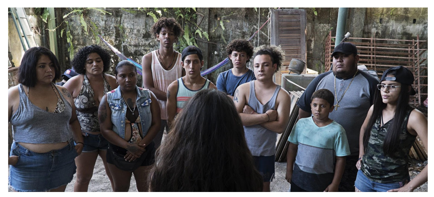
Pictured above: A group of the non-professional cast members from Puerto Barrios in a scene from Cadejo Blanco.